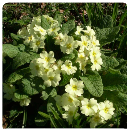
I smelt the flowers