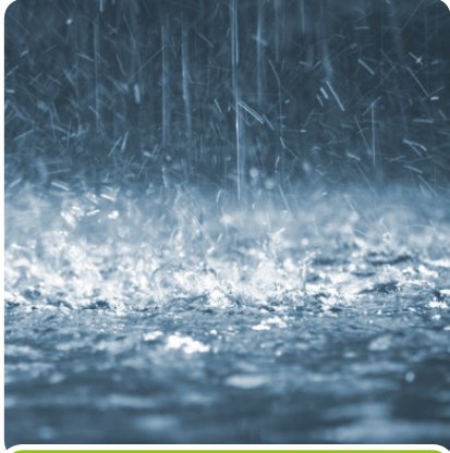
I got wet

Go for a Spring walk and use your senses to look, hear, smell and feel what is around you. Use the list below to help you describe your walk.