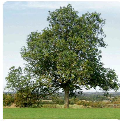
I heard the wind in the trees