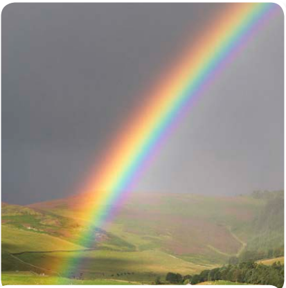
I saw a rainbow