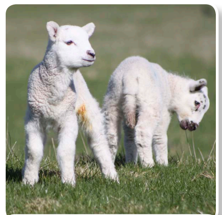
I saw some baby lambs