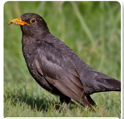
I heard birdsong