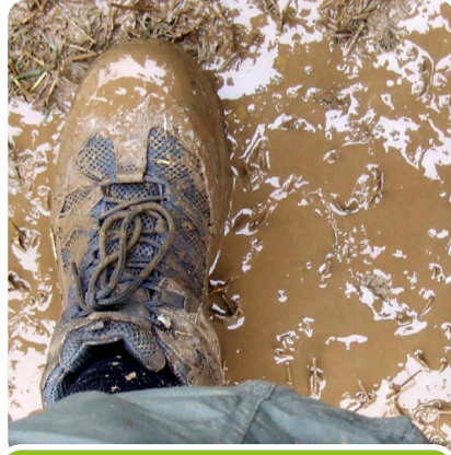
I got muddy